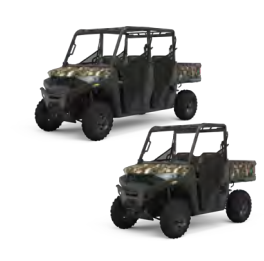
MODEL SHOWN: RANGER SP 570 PREMIUM