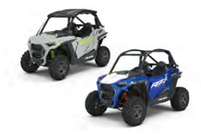
MODEL SHOWN: RZR TRAIL AND RZR TRAIL S See pages 32-33 for full lineup.