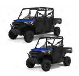
MODEL SHOWN: RANGER 1000 PREMIUM