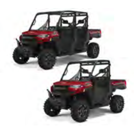
MODEL SHOWN: RANGER XP 1000